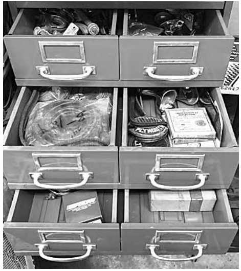
Parts cabinet looks fairly well-sorted, but there are stacks of things that would require an expert eye to identify.

There is supposed to be interior material for the Sedan, I think, more